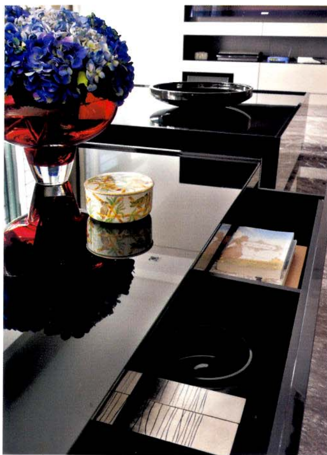
above Drawer space in the customised coffee tables stash knick-knacks while the reflective glass top breaks the monotony of the black acrylic finish and adds class.

To camouflage the structural column – which couldn't be hacked when the walls were taken down to merge the two units – the designer clad it with tinted mirrors to expand the space and create a more intimate ambience. "I was lucky that the position of the column didn't eat into the dining room space," says Benjeemen. >