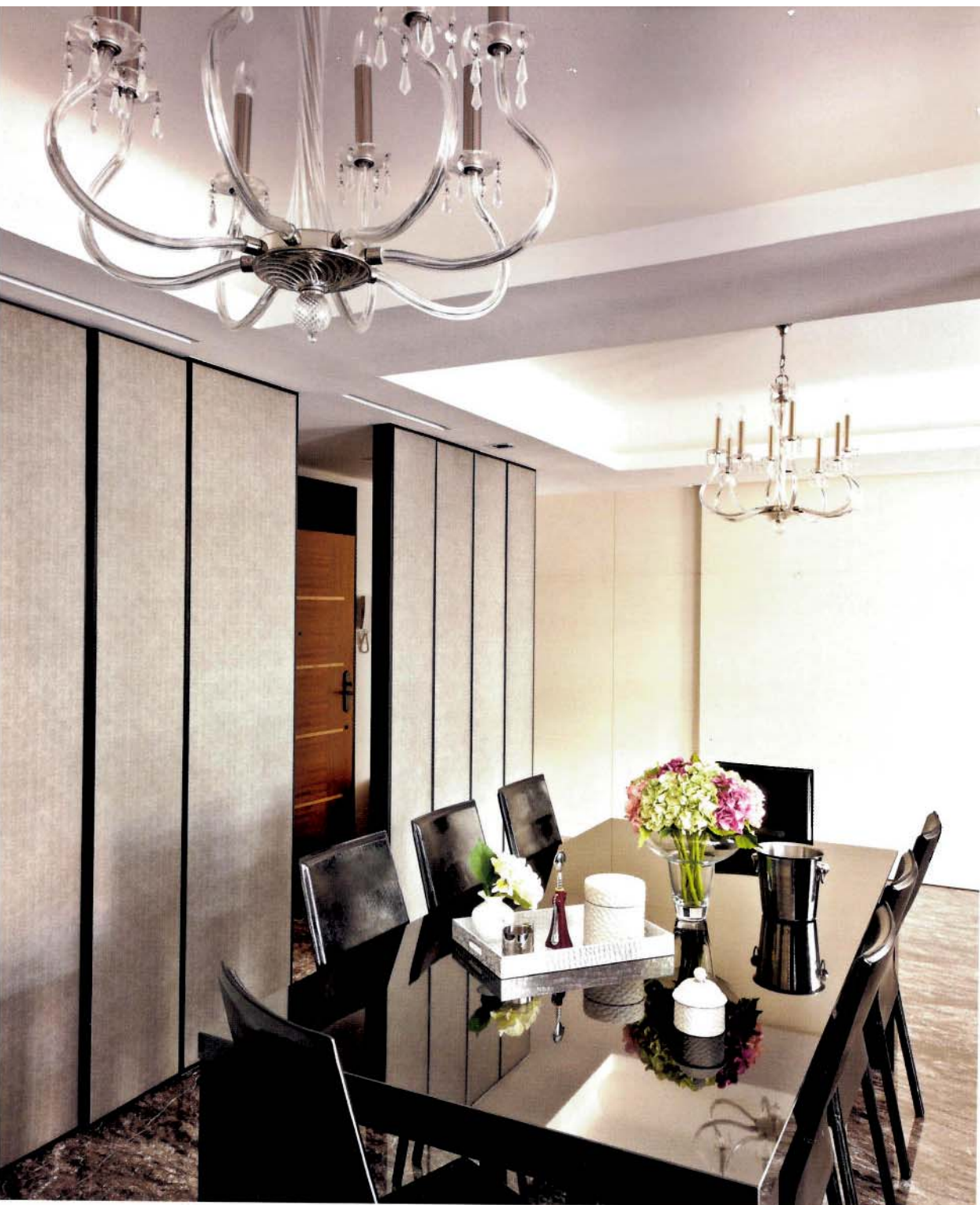
The panels located behind the dining table conceal storage space and double up as decorative accent walls.

The “balance” of the spaces is further emphasised by a series of twin pairings – the red leather armchairs, black acrylic coffee tables in the living room and crystal chandeliers in the dining area.