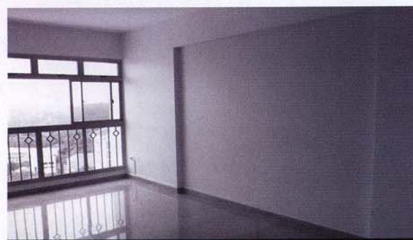
The bare 968sqf four-room HDB flat at Strathmore Avenue (VIEW FROM THE KITCHEN)

Dreaming of a plush, upscale abode, or a light and bright modern pad? Every decor theme is created by a careful choice of materials in the flooring, upholstery, curtains and so on, picked for the look and function they bring to the space. Space planning is also crucial, especially for a small abode. Designers have to deliver interiors comfortable to live in, with enough storage for the occupants. We tasked three interior designers to design the living and dining areas of a four-room HDB flat, giving the space vastly different in-demand styles. Find out what materials were used and how.